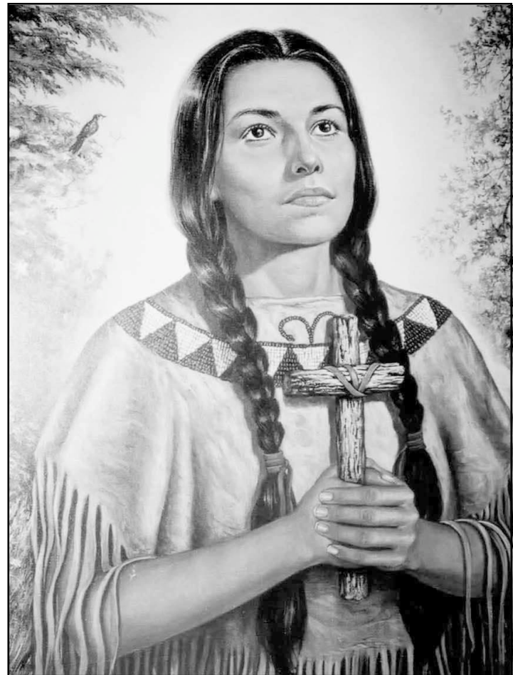
Blessed Kateri Tekakwitha, Lily of the Mohawks 1656-1680